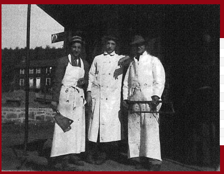
General Store butchers